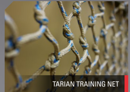
TARIAN TRAINING NET