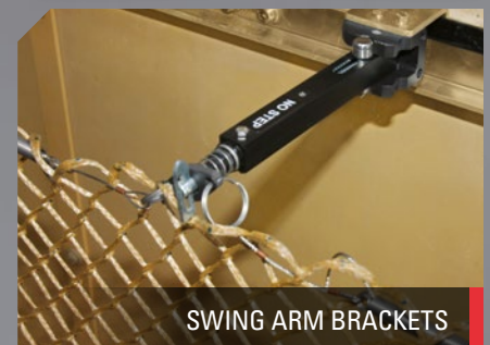
SWING ARM BRACKETS