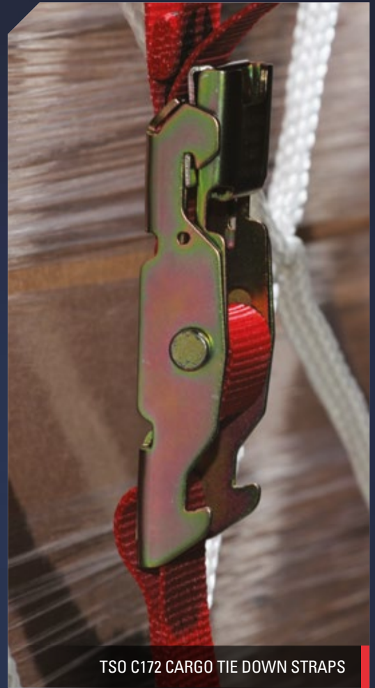
TSO C172 CARGO TIE DOWN STRAPS